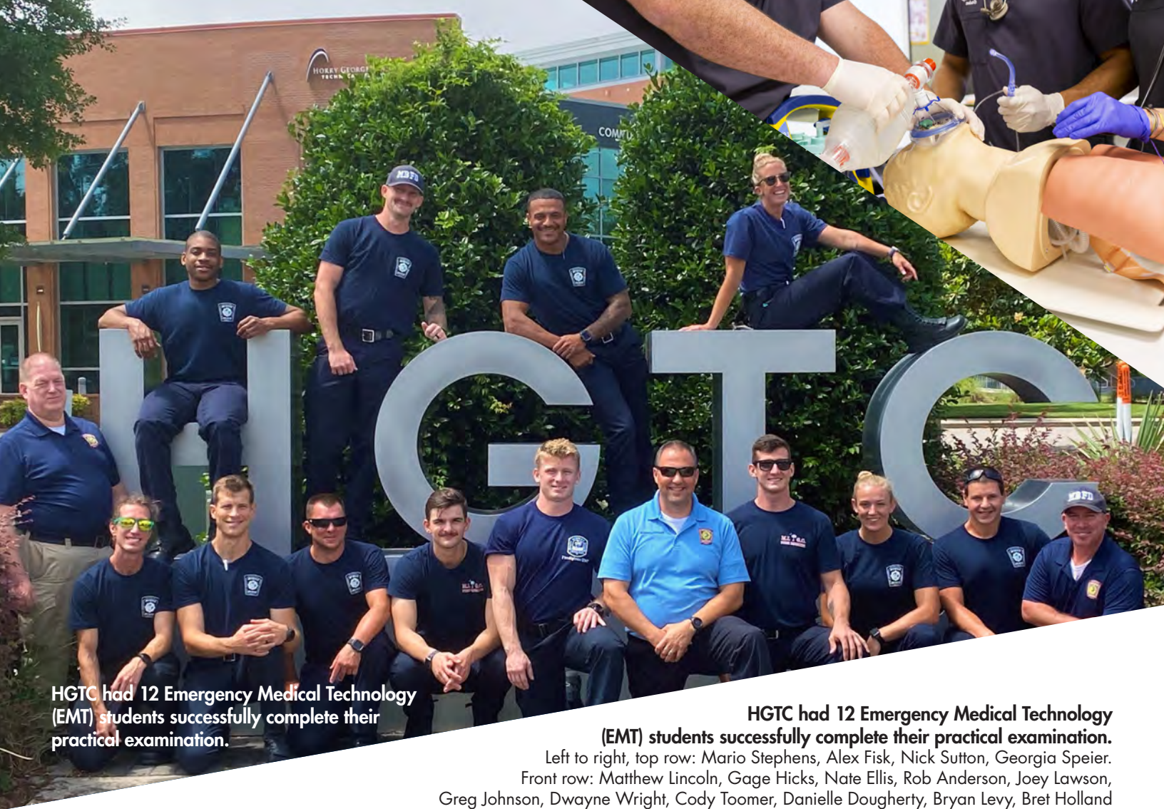
HGTC had 12 Emergency Medical Technology (EMT) students successfully complete their practical examination.